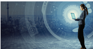
Autonomous Wave Control (AWC)

Allied Telesis provided training to the school’s IT staff so they are able to operate the network for themselves. In addition, Allied Telesis is working with the computer science program at the school to build a customized training program for their students. The training will be based on the ATI technical training curriculum, and it will help students develop new skills and knowledge related to the networking domain.