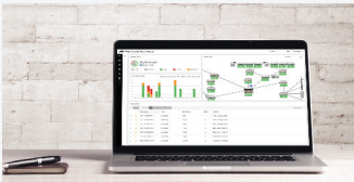
Vista Manager EX